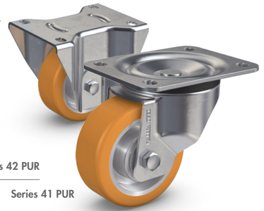
Series 42 PUR