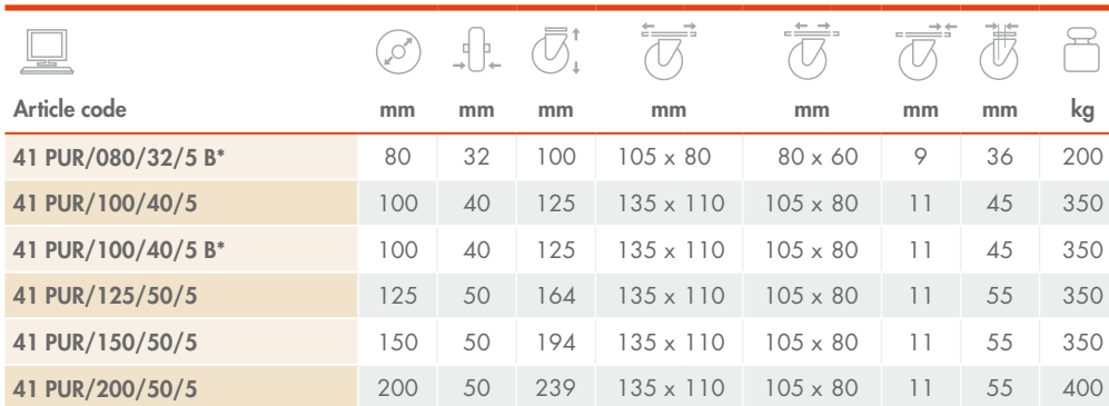
Series 41 PUR